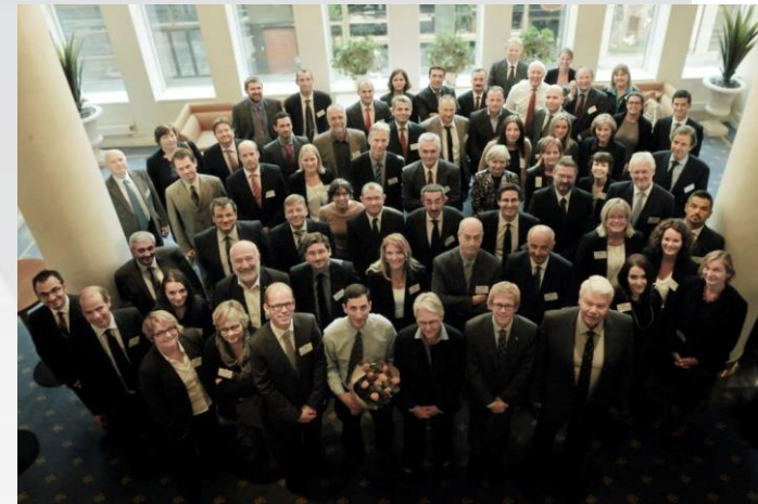
European Forum for Disaster Risk Reduction EFDRR Oslo, September 2013