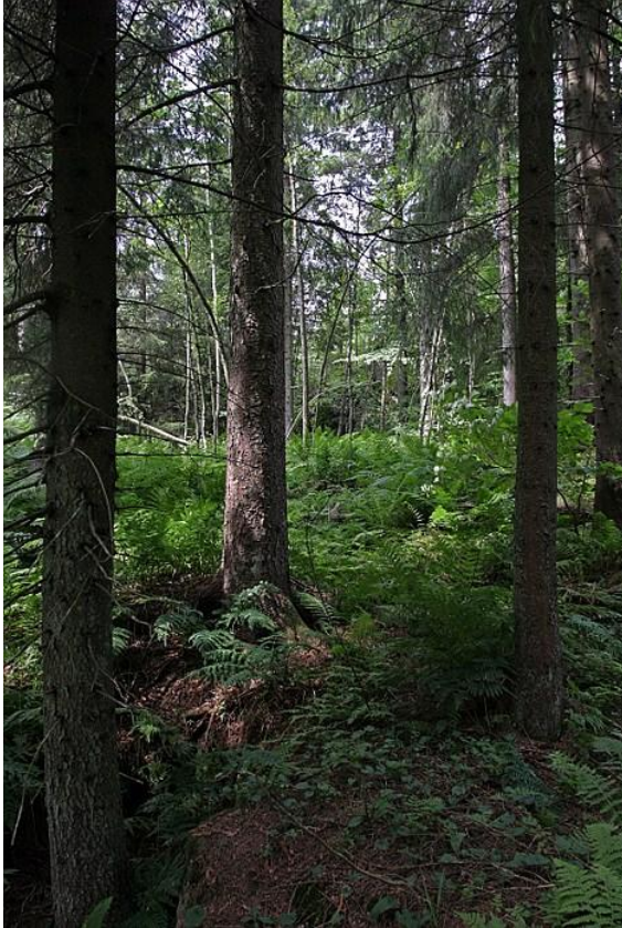
Fern forest with ditch network.