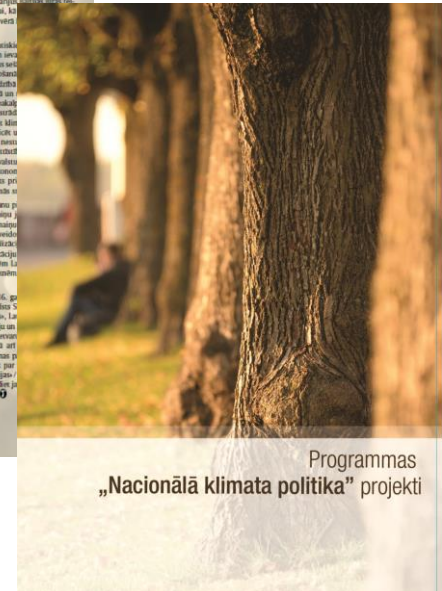
Programmas „Nacionālā klimata politika” projekti